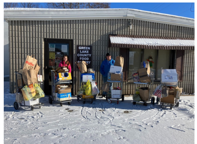
GLC 4-H Ambassadors delivered food to GLC Food Pantry

Green Lake County 4-H Ambassadors: In 2024-2025, I took over as leader of the GLC 4-H Ambassadors. The youth decided to host their annual Chicken Chase and start an Agriculture Olympics at the fair for youth to learn about agriculture. They also hosted their annual food drive to give back to the GLC community and gathered 841.5 lbs of food to donate! The Ambassadors also learned about the GLC Food Pantry and who they serve touring the facility when they dropped off the donation.