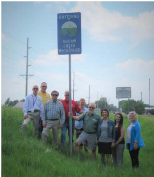
Watershed sign in Iowa .