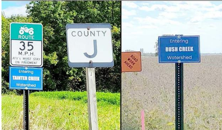
Watershed signs in Vernon County Wisconsin