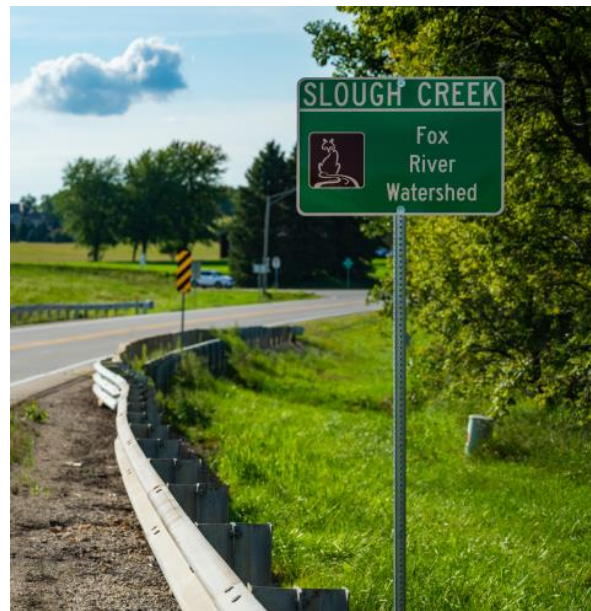
Stream and watershed sign in McHenry County, IL