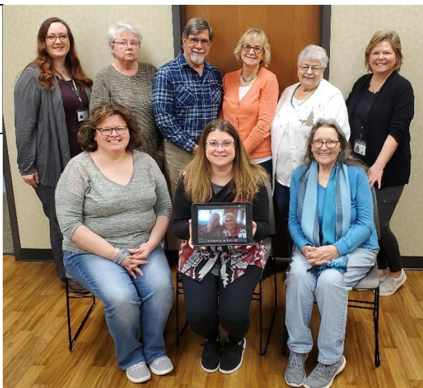
Green Lake County Health Department's first group of participants of the Diabetes Prevention Program appearing both in person and virtually!