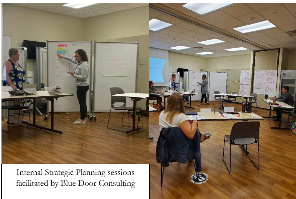
Internal Strategic Planning sessions facilitated by Blue Door Consulting