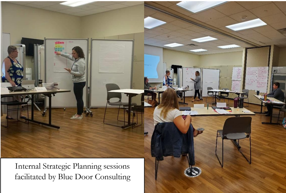
Internal Strategic Planning sessions facilitated by Blue Door Consulting