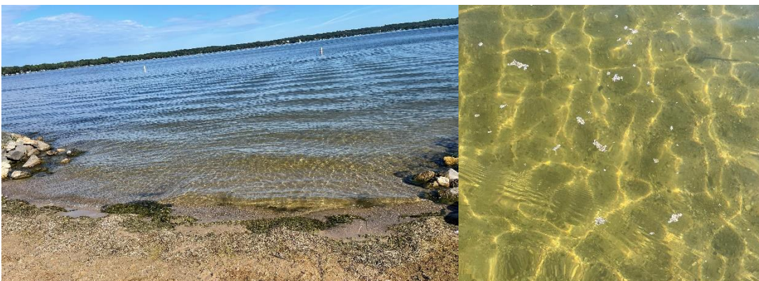
The Health Unit partnered with the Green Lake Association (GLA) and Green Lake Sanitary District to pilot a new Blue Green Algae monitoring program.