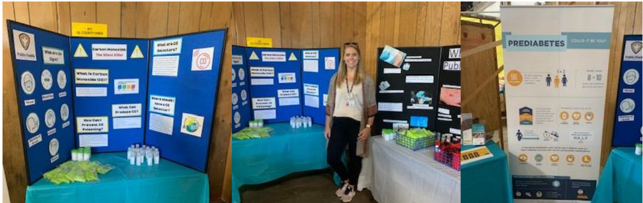
2022 Green Lake County Fair Booth: “What is Public Health?”