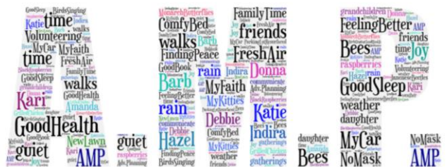
Aging Mastery Program

August 4 th marked the end of the 6-week AMP series I was teaching and facilitating for caregivers in Green Lake and surrounding counties. There were 7 participants who completed the program. Lessons were held for 3-hour sessions each Wednesday morning for 6-weeks this summer. I am collecting evaluation data and will share as I receive that information. Each class we collected at least one thing everyone was grateful for and made a wordle (pictured right) for the AMP graduation following our final class.