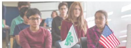
GREEN LAKE COUNTY 4-H 2020 Virtual Youth Awards Program

Many 4-H members in Green Lake County completed the 2019-2020 4-H Record Books in which they have reflected on their growth and exploration of their 4-H year. Throughout the completion of 4-H Record Books, 4-H members share the story of their 4-H year, ways they have given back to their community, and share their goals and progress of goals which they set in various project areas. 4-H Record Books are evaluated at the club level and then nominated to receive county level awards.