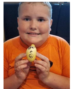
GLC 4-H proudly displaying his Stress Ball Friend he created as one of his activities. This activity focused on emotional health.