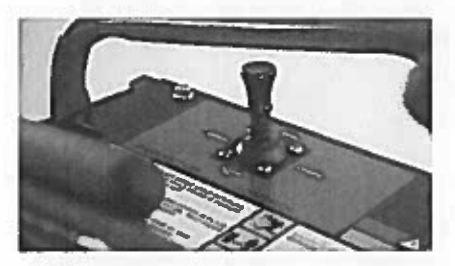
Joystick Deflector Control

The joystick allows the operator full control of the air flow direction – forward, left and right. Pulling back on the joystick closes all deflectors for transport.