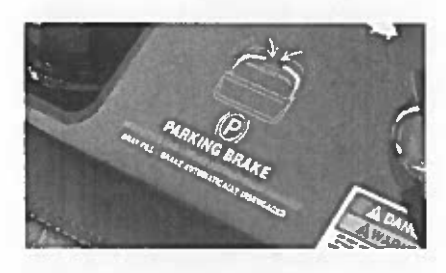
Automatic Parking Brake

Non-skid platform and padded thigh pad offer ease of operation and operator comfort.