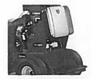
Ergonomic Platform and Thigh Pad

The right discharge is ideal for deep cleaning or blowing above gravel roads and driveways. The center discharge plumes to the right and is ideal for cart path and trail cleaning. The left discharge has the patented Dual Deflector Air Flow System™ for operator controlled twin air columns. This patented undercut allows for downhill blowing.