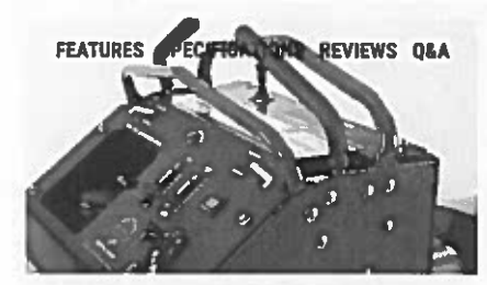
Quad Control Handle System™

This system provides automatic return to neutral, integrated operator presence, self-activating parking brake and travel direction control.