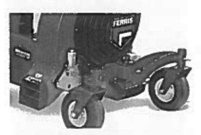
Torsion-Mounted Front Axle Assembly

An integrated LED light in the operator tower allows working and loading into dusk, extending the work day.