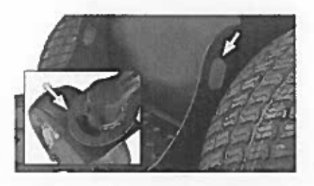
Front & Rear Tie Downs

Self activates if the need to briefly step off of the machine arises.