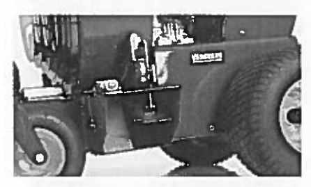
Dual Deflector Air Flow System™

This system provides automatic return to neutral, integrated operator presence, self-activating parking brake and travel direction control.