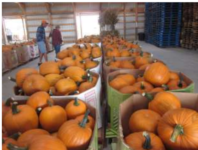
Fig 1: Pumpkins and Hay sale in Tri-County Produce Auction