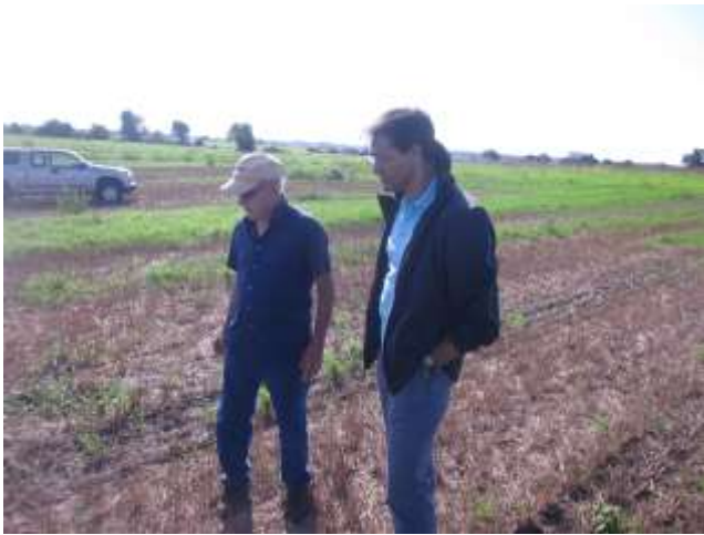
Fig 2: A farmer in Markesan showing his piece of land where cover crop was not germinated.