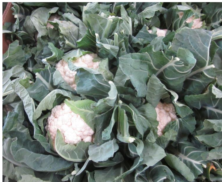
Cauliflower for sale in the auction