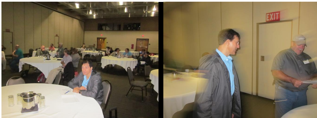
Figure 3: Agent attending the UW-Extension ANRE Conference in Oshkosh, WI

A three-day UW-Extension ANRE Conference was held in October in Oshkosh, WI. Agent attend the conference and participated in break-out sessions. The future of ANRE for Wisconsin residents and needs of various educational program to solve the complex problems with the changing needs of the communities was also discussed.