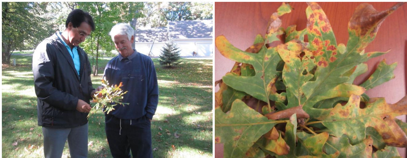
Fig 2: A homeowner in Town of Green Lake with Oak leaf blister disease asking for assistance

An example of the Oak leaf blister disease and a homeowners in Town of Green Lake asking for advice with the the agent is shown in the photo below.