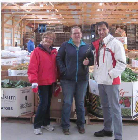
Fig 1: Farm-to-School meeting participants

In the auction, I conducted a meeting with farm-to-school outreach coordinator, UWEX Agriculture Agent of Marquette County, and the auctions staff to start a farm-to school program in which Montello, West Field and Adams county school district will buy fresh food from auction. This will initiate a fresh and healthy food cooking in the school kitchen for students and staff.