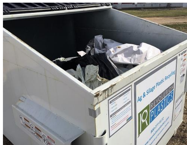
Fig 1: Revolutionary Plastic Dumpster Placed on a Farm and Collected Ag Plastics