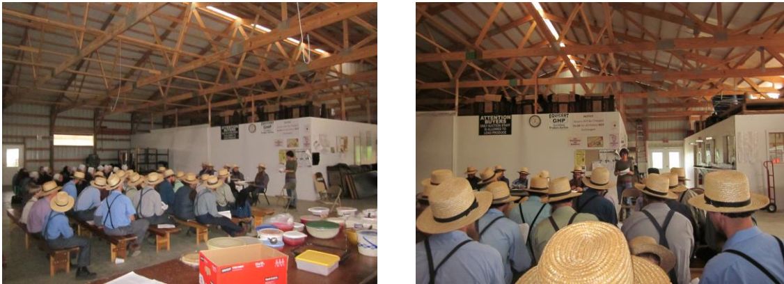
Fig 1: Growers Meeting on Harvesting and Handling Winter Squash