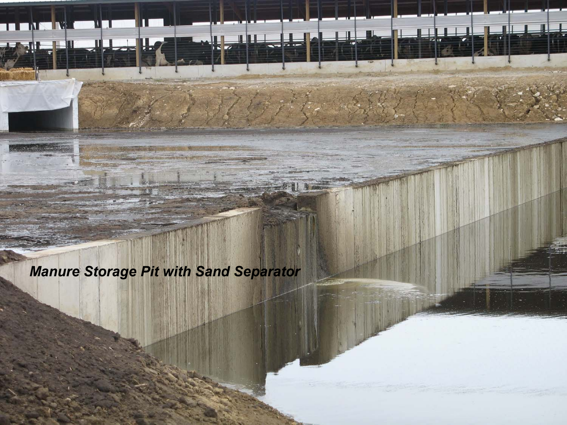
Manure Storage Pit with Sand Separator