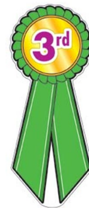
Crystal Caulfield All Saints Catholic - Berlin 3rd—County