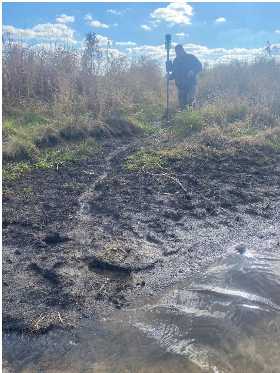
Private Lateral draining to Lateral A