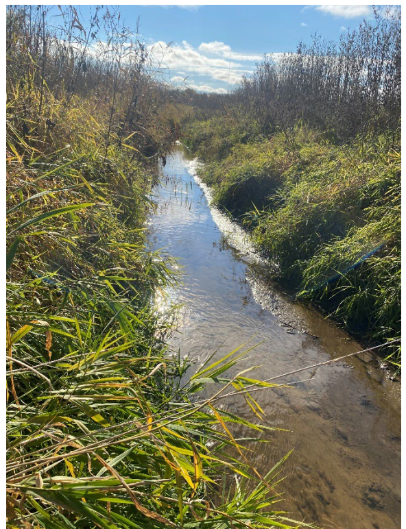
Corridor culvert Zietlow land and private lateral between Zietlow and Schrock