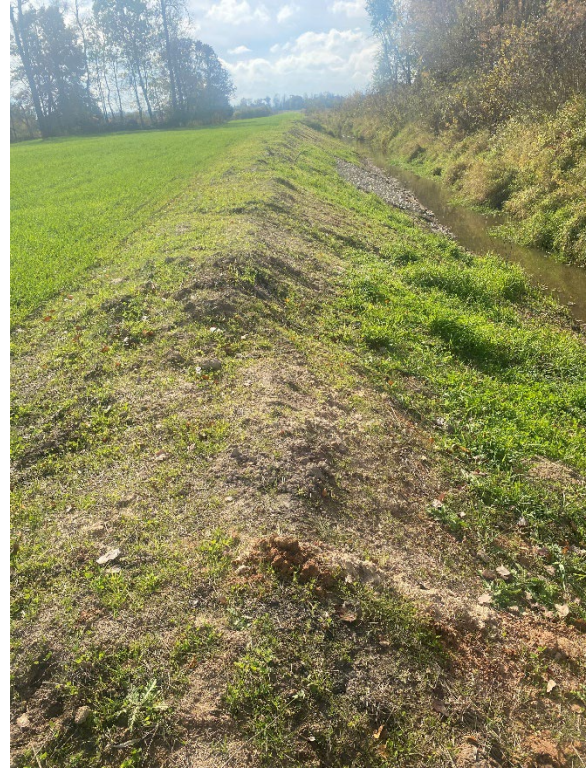
Schrock Bank Repair