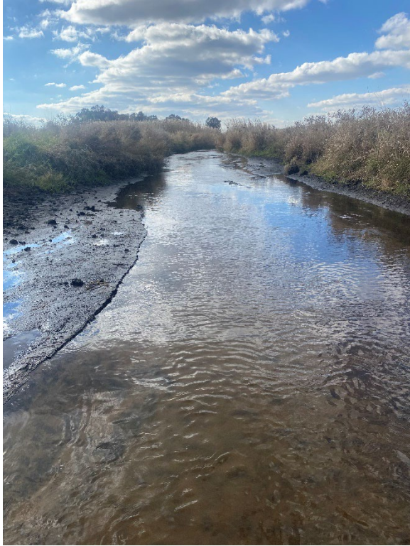
Lateral A looking upstream