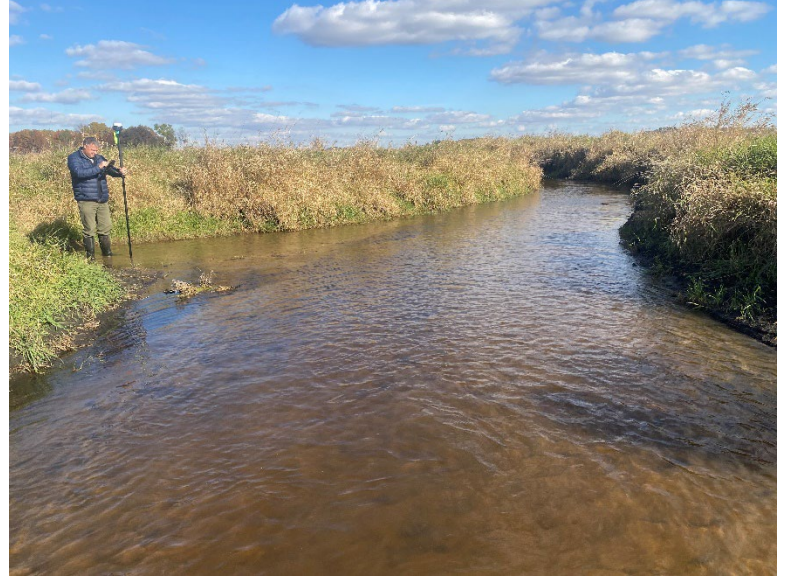
Lateral A looking downstream