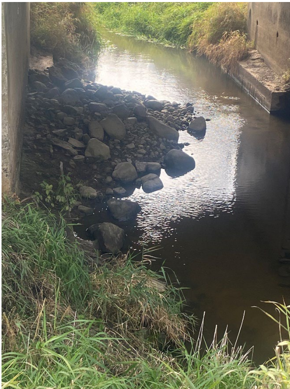
Rocks under Hwy E