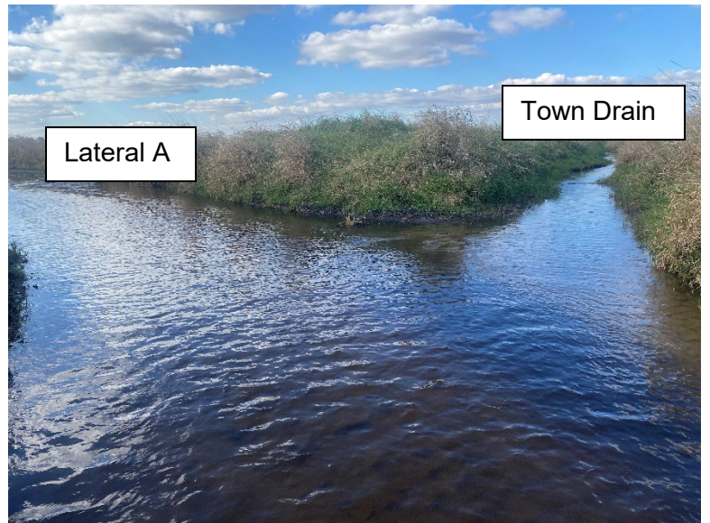
Lateral A and Town Drain Junction