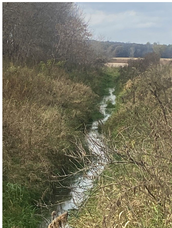
Ditch/Trees – along corridor (Guden property)